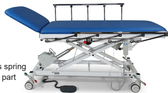
Model 2052-00XLE with options: Movable on twin castors with central lock (1180N), 2 side guards lateral lowerable (1080); upholstery colour: 64-174 sky