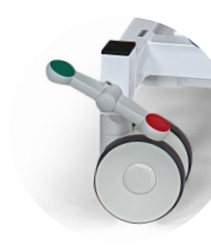
Art. no. 1185 Movable on comfort twin castors, Ø 125 mm with central lock, basic height + 50 mm