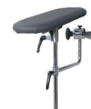
Art. no. 1440 1 arm rest for side rail, without attachment clamp