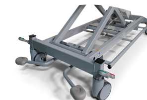
Art. no. 1960E Foot switch rail, surround, security adjustment