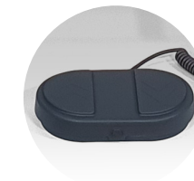
Art. no. 1910E Foot switch (low voltage)