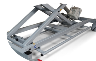
Art. no. 1950E Foot switch rail, lateral, on both sides, security adjustment