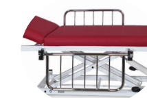
Art. no. 1040 1 side guard tiltable, chromium-plated, completely made of steel tube, length: 700 mm