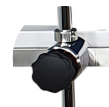
Art. no. 1430 1 attachment clamp for side rail, suitable for pipe: Ø 18 mm