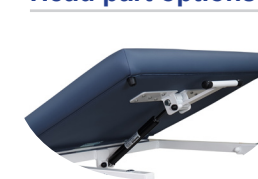
Art. no. 1655 Head part stepless adjustable by gas spring (0° to +55°)