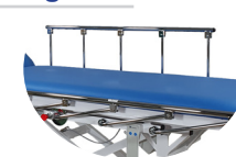
Art. no. 1080 1 side guard lateral lowerable, chro- mium- plated, completely made of steel tube, length: 1060 mm