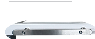
Art. no. 1410 1 piece of side rail, length: 350 mm