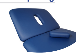
Art. no. 1610 Nose opening, in head part Art. no. 1620 Upholstery part to close