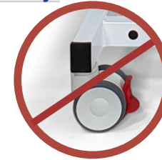
Art. no. 1182 Without standard mobility