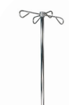
Art. no. 1450 Infusion pole, without attachment clamp