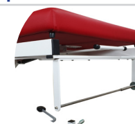
Art. no. 1265K / 1280K Paper roll holder, mounted under head part (not protruding), for width 650 mm / 800 mm