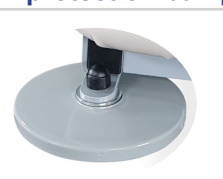
Art. no. 1170 1 wall protection bumper Ø 150 mm; in case of side rail 1080: art. no. 1171, Ø 200 mm