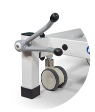
Art. no. 1045N Wheel-lifting/fixing mechanism with 4 foot levers for controlled lowering