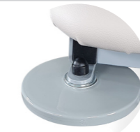
Art. no. 1175 4 wall protection bumpers Ø 150 mm, including mounting, for width 700 mm