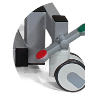
Art. no. 1187 Movable on twin castors with central lock, Ø 100 mm, lower underframe, table height 540 mm – 980 mm