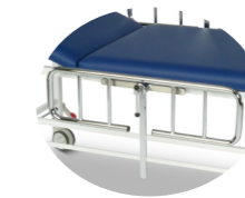
Art. no. 1005 1 side guard to fit on side rail, with attachment clamp, chromium-plated, length: 800 mm