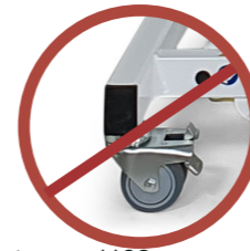
Art. no. 1182 Without basic mobility