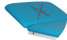
Art. no. 1615-EF Without nose opening