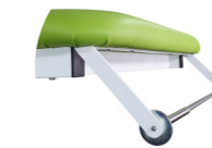
Art. no. 1270F Paper roll holder, mounted at foot part (protruding: 70 mm), for width 700 mm