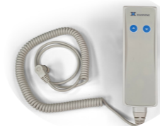
Art. no. 1920E Hand switch (low voltage), with magnet on the back to fasten