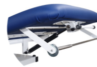
Art. no. 1270F/K Paper roll holder, mounted under head part (not protruding), for width 700 mm