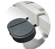
Art. no. 1940E 1 foot switch fixation mounted at underframe