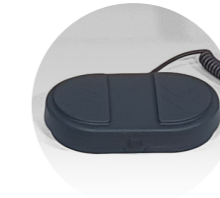
Art. no. 1910E Foot switch (low voltage)